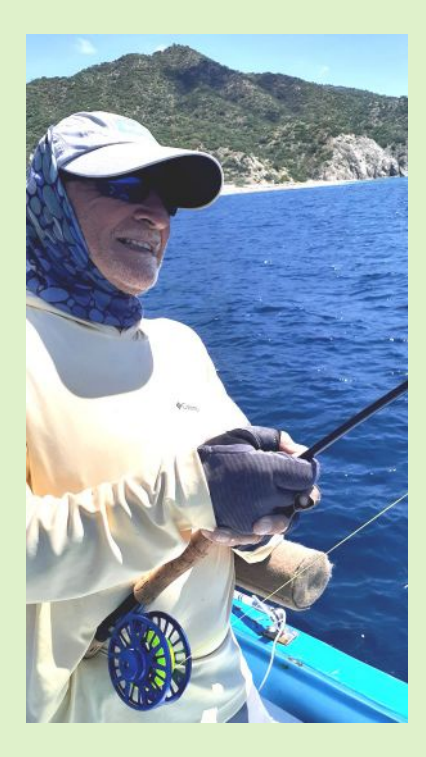
Did I ever tell you about that 60lb rooster I broke off at the Island?