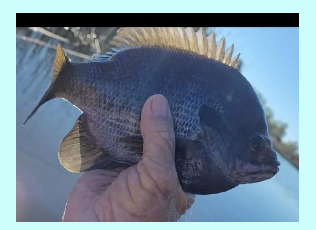
Kirk is hooking some slabs at Murray.