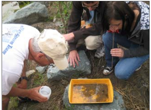
Checking out the critters.

All in all, it was a good day. We all had fun and learned something about our local urban streams and the critters that live in them. The results of the