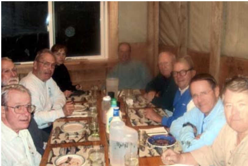
Dinner is served.