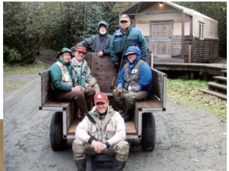
On the road again to the Italio River with cabins in the background.