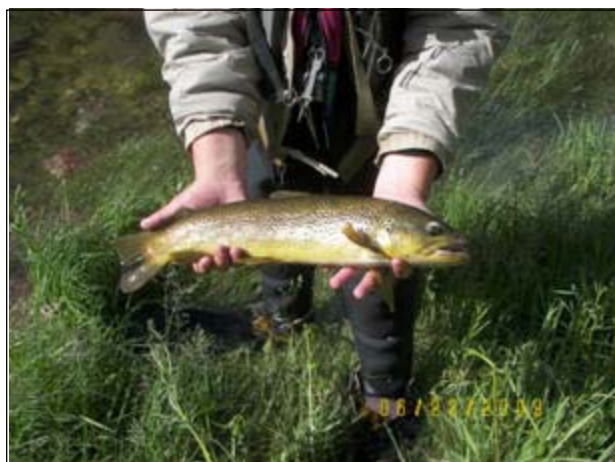
Jesse Tuman's big brown trout.

Afternoon Monsoon Rains and high wind accompanied the anglers every afternoon while they floated their pontoon boats down the river. The scenery was still great, but the fishing was sub par. Missing was the famous cicada and grass hopper hatches. The river had been stocked with 43,000 small 6 to 10 inch rainbows and they were willing