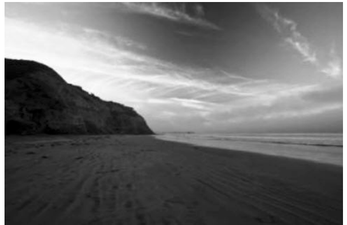
Low Tide at Blacks

Most of the anglers migrated north to see if we could determine where the new boundary of the Marine Preserve would be and if we find a suitable landmark. Norman Orida sent out a note that the big white Razor House, which looks like it should belong to Salk Institute, is close. We can see it from the beach.