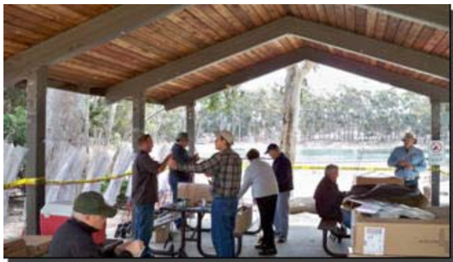
Volunteers assemble rods and reels before the derby.