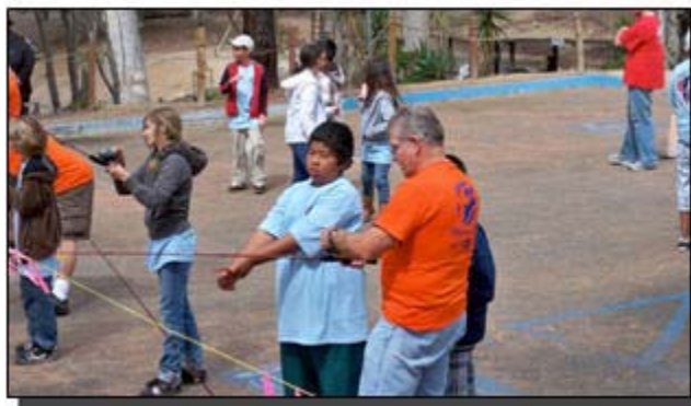
Members of the Road Ranger Bass Club instruct young anglers on casting.

Club, and San Diego Fly Fishers, 320 young anglers received instruction on fishing techniques and a new rod and reel.