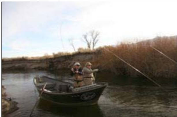
Double hook-ups on the Lower Owens

Brokeback Tiger Midge an articulated midge pattern by Tom Loe, Sierra Drifters. (Photo 1)