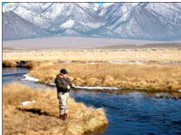
A couple of beauties on (the fish, that is...)