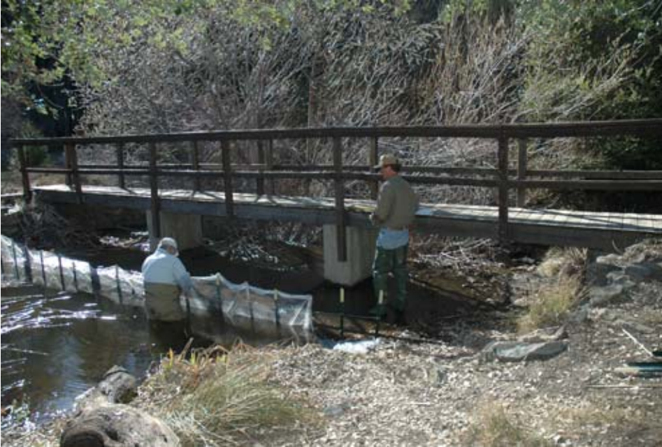
Doan Pond weir.