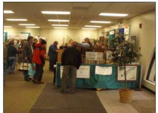
Cane rod dealer.