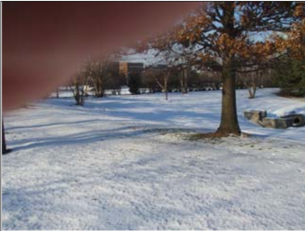
Shortcut to the show.