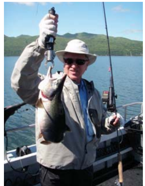
Art with a buck Pink Salmon caught sight fishing from the boat in the salt. Notice the pink fly.